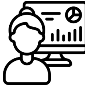
Employer / manager

Have at least 1 - 2 letters from an activity described as most meaningful