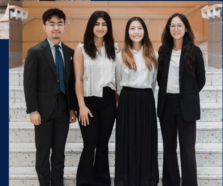
2022 Pre-Doc Research Fellows